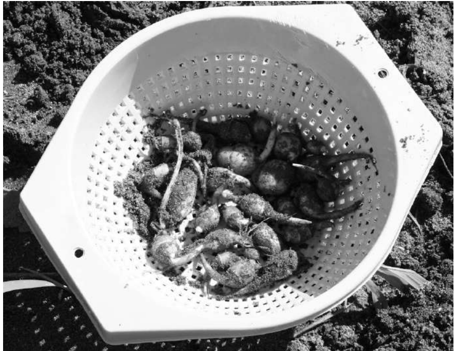
The tasty bit of the Wapato plant, ready for processing.