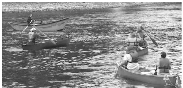
Four of the five vessels leaving on the Float Friday morning.

Day four, Labor Day, Sa ho ee titla was brought