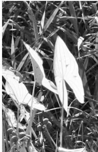
Top bit of a Wapato plant.

Director, Cultural Resources Department.