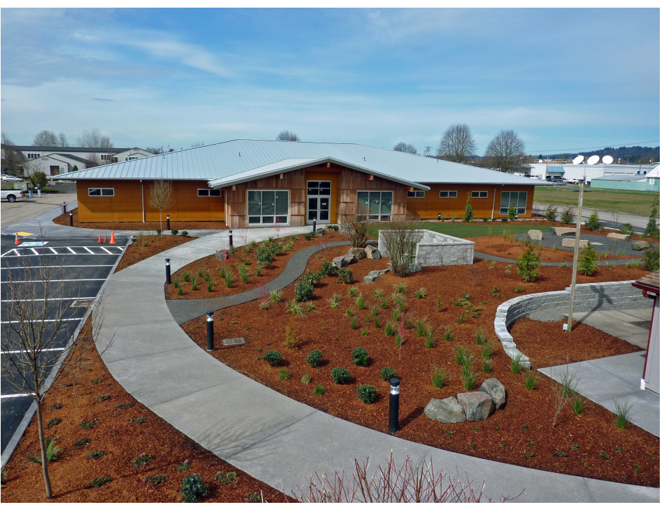
New Tribal Clinic in Longview, WA

The Transit Program now has a Medicaid and Reserve-A-Ride contract with Human Service Council out of Vancouver which covers Cowlitz and Clark counties. This contract is a reimbursement of qualified riders that comes back to the Transportation Department. The department is currently working with the broker that services Lewis and Thurston counties so we can get reimbursed for