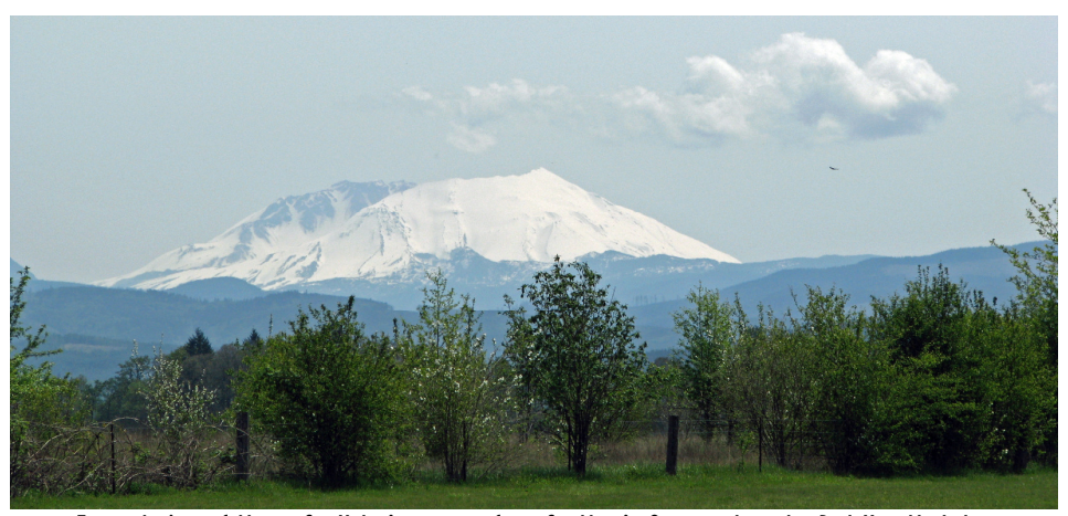
Zoomed view of Mount St. Helen's as seen from St. Mary's Center