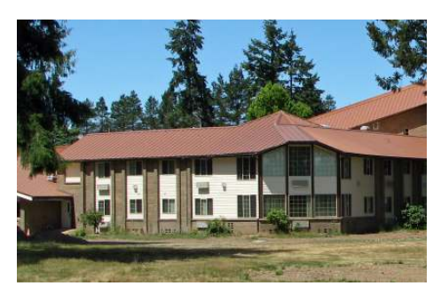
St. Mary's Nuns' Qtrs chairs, refrigerator, and convection oven with microwave.

All utilities are paid for you including basic cable TV. Rents are a straight 30% of monthly income.