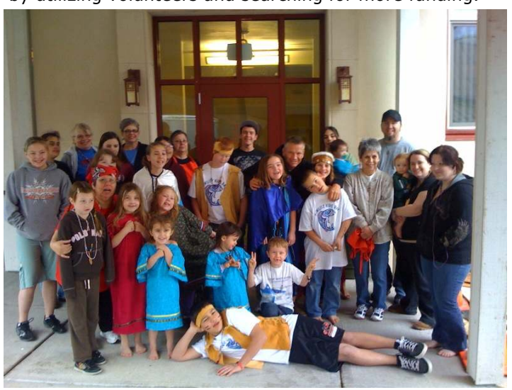
Kids Camp at St. Mary's, April 3, 2010—Photo by Teri Graves

We recently provided Elders/Youth activities during Spring Break. We hope to be able to do this more often, by utilizing volunteers and searching for more funding.