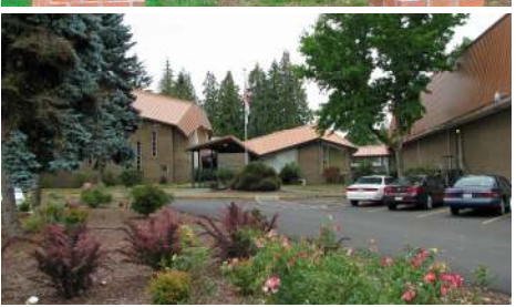
St. Mary's

A variety of accommodations are available, from efficiency apartments to 2-bedroom condotype units. Rents range from $100 to $652 per month, depending on size, amenities, and resident income.