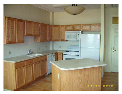
St. Mary's Condo

The Condo-type apartments, which are located in the classroom wing of St. Mary's, range from studio size to 2 bedrooms.