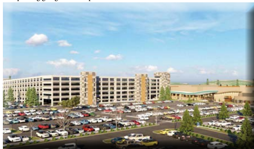
Architectural rendering of ilani's parking garage