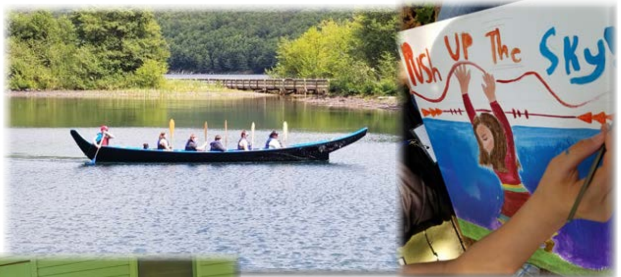
Top left: A high school gets a group lesson on the water.

Be on the lookout for in school sessions in Longview and Kelso and young adult groups in Clark County