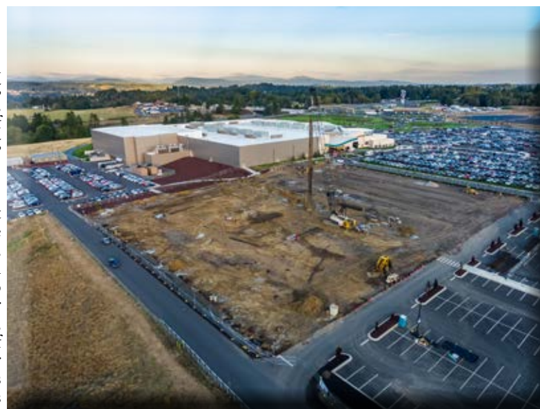
Parking garage construction beginnings, with view of parking lot expansions

The Longhouse recently went through an expansion and upgrade as part of a capital expenditure project slated for 2019. Swinerton Builders took operations recommendations for design and function to expand the floor space from the former Promotions area into a warm and inviting space for Longhouse customers.