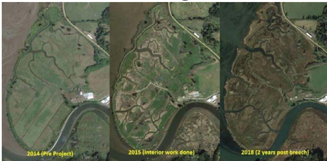
Google Earth Images, 2012 taken before construction work began, 2015 with the interior work done, and 2018 with the levee breached

Prior to the 1850's the lower Columbia River had thousands of acres of floodplain habitat that provided food and refuge to out-migrating salmon. Much of that type of habitat is gone now, diked off and converted to towns and farms. Opportunities to open up habitat for fish and wildlife are few and can be costly and time-consuming to achieve.