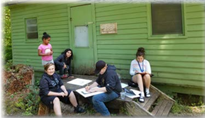
Bottom left: Youth camp participants prepare for their storytelling