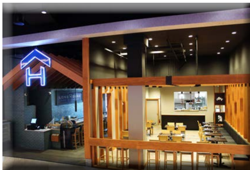
The Longhouse restaurant with additional seating

As part of this project, a natural gas pathway was needed to route the service to the patio. This also created an opportunity to respond to ongoing team member feedback to separate the outdoor break area to allow for a non-smoking section for our team. As a result, an additional patio was poured at the employee entrance and natural gas has been added to this patio for direct supply to gain efficiency with the use of outdoor heaters.