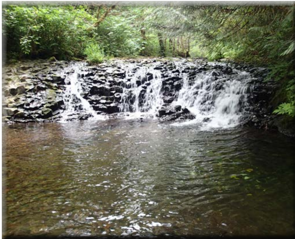
The Sarah Creek Habitat Restoration Project provided fish passage over a low bedrock falls, and improved spawning and juvenile rearing habitat for coho salmon, steelhead, and cutthroat trout. Sarah Creek is a tributary to Abernathy Creek west of Longview. The work was funded by a $698,824 grant from the Washington Salmon Recovery Funding Board.