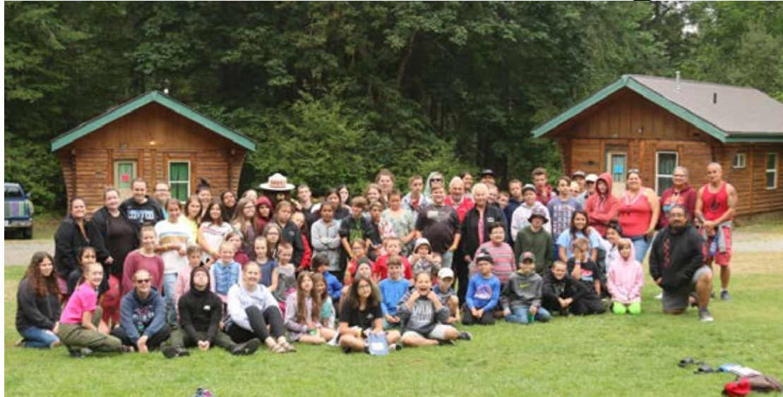
Smokey the bear paid a visit to the kids this year at Cowlitz Kids Camp 2019