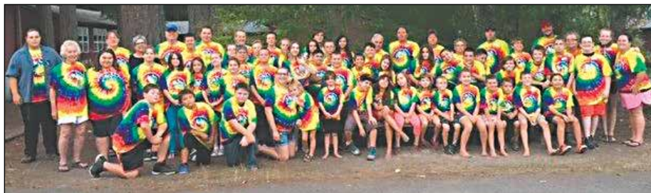
Youth summer camp at Cispus.

These activities and sessions included identifying Native plants and trees indigenous to our aboriginal land. This was conducted by the