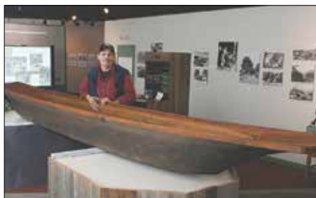
Above: Finished canoe at Cowlitz County Historical Museum.