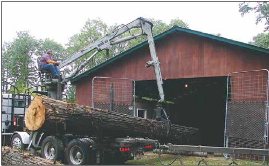
The canoe log was donated to the Cowlitz Tribe by the Gifford Pinchot National Forest in 2011.