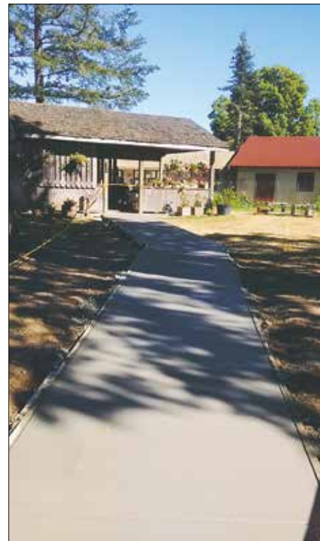
Cowlitz Village paved a new sidewalk to their fish house. It is now accessible to all Elders.

buildings making it possible for all tribal members and guests to enjoy many futures events here at St Mary's.