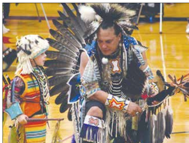
Traditional cultural teachings in action.