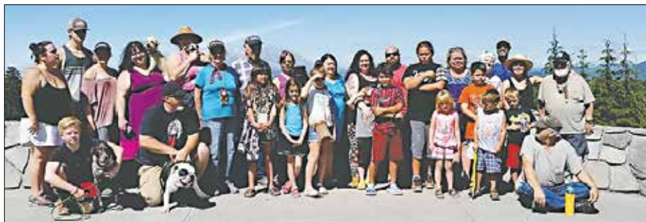
2016 Huckleberry Camp attendees at a viewpoint en route to the Indian Heaven berry fields.