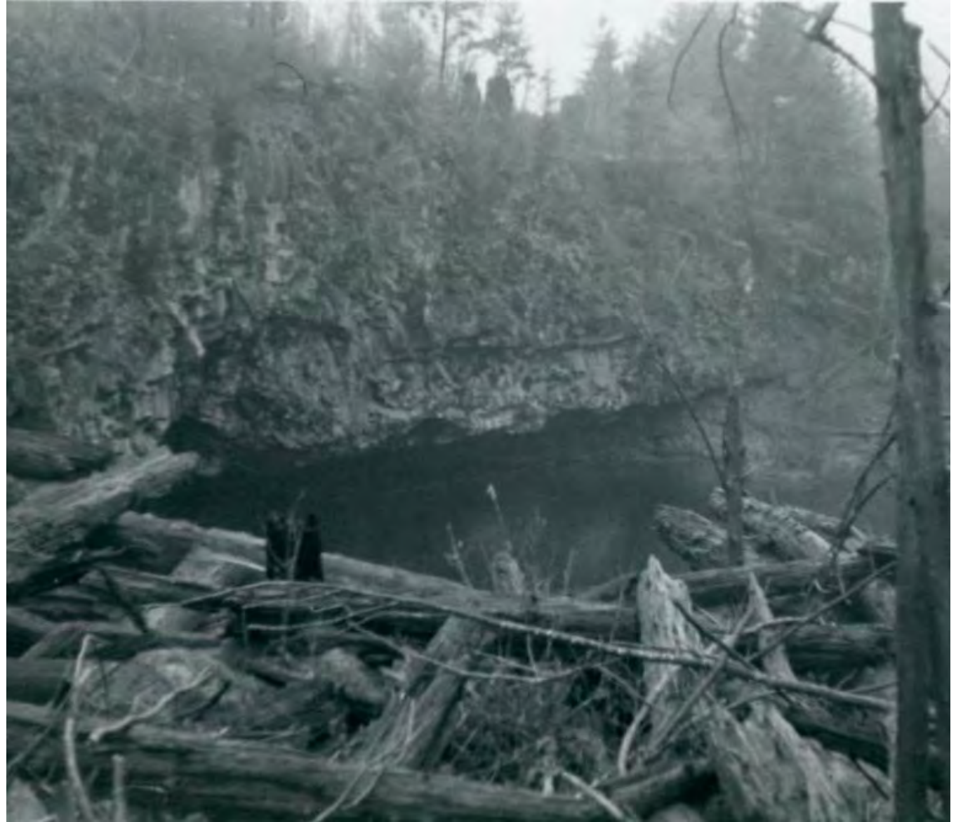
Pre-Kwoneesum dam construction – Splash Dam footprint in canyon mouth.